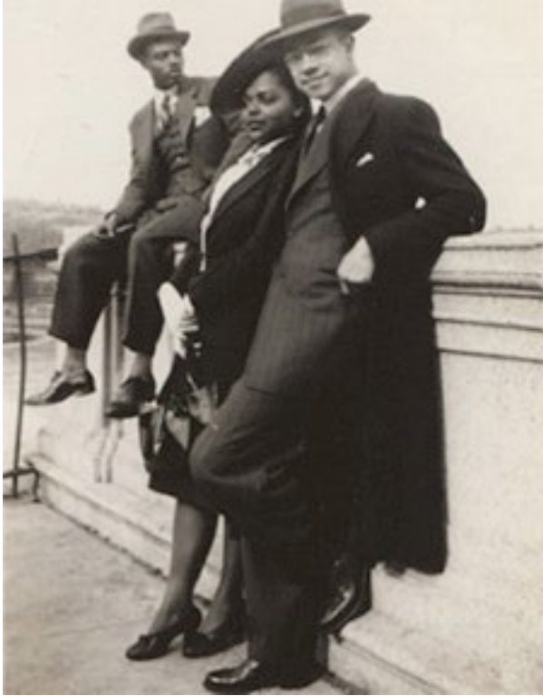
A sharp-dressed man is fine; a sharp-dressed man with a degree & options is even better.