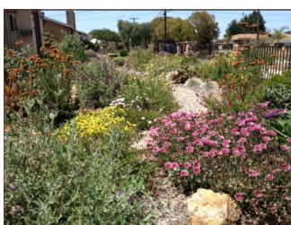
Above, grass dominated in the "before" view of Tracey's project. At left, plants bloom in the new landscape.

"This yard in particular exemplifies how we can change our use of water through design and education to the public as to what can be the 'new normal' in California landscapes."