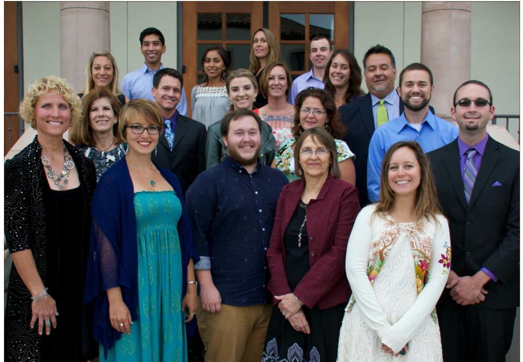
The 2014 CCBS scholarship recipients.

Get the Urban Horticulturist delivered directly to your "in" box! If you don't already receive our online version, signup is easy: Go to www.cuyamaca.edu/ohweb and click on the "Newsletter" link, or find us on Facebook.