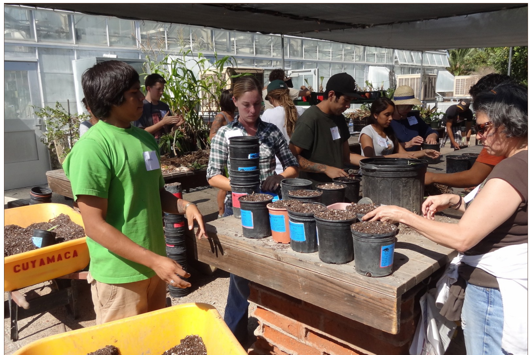
Interns along with student volunteers work together to propagate plants that will eventually be sold at the Cuyamaca College Nursery.