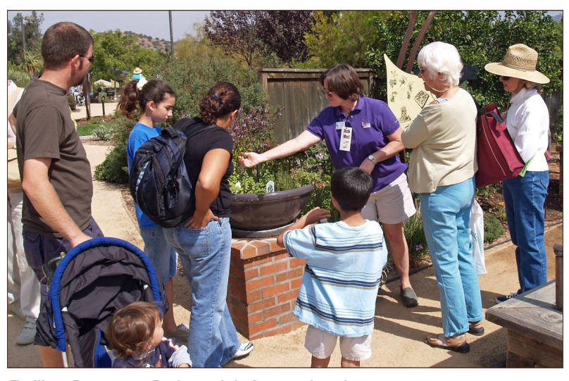
The Water Conservation Garden is a hub of activity these days .

Then the water shortage hit. Summer of 2009 has brought the first water restrictions in many