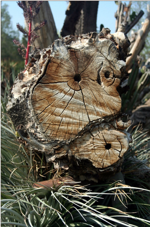
Everyone who saw this photo laughed out loud. We're just not sure of who it reminds us!