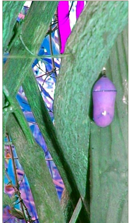
This picture's striking changes in color and texture made it a winner.