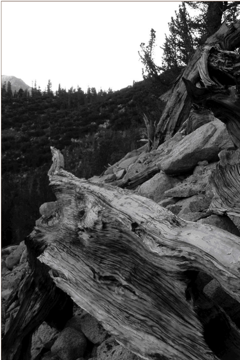
The light, definition and depth expressed in this photo made it a stand out.